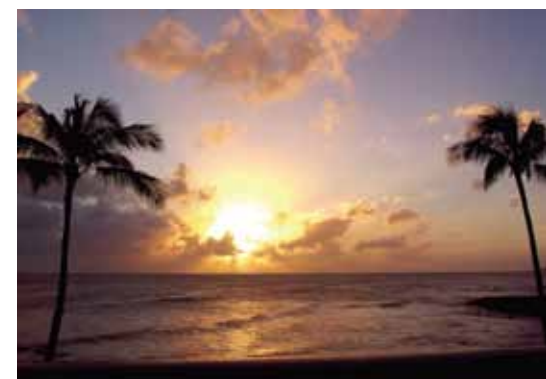
EXHIBIT AND SUPPORT OPPORTUNITIES

Please note: pre-registration will be accepted through February 9, 2010. After this date, registrations will only be accepted on-site and will incur an additional $25 fee